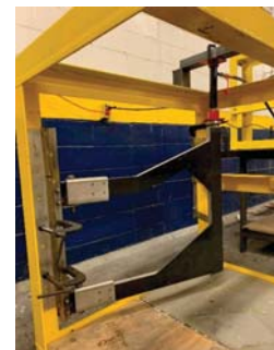
Abuse Tolerant Vertical load test beyond 300lbs.